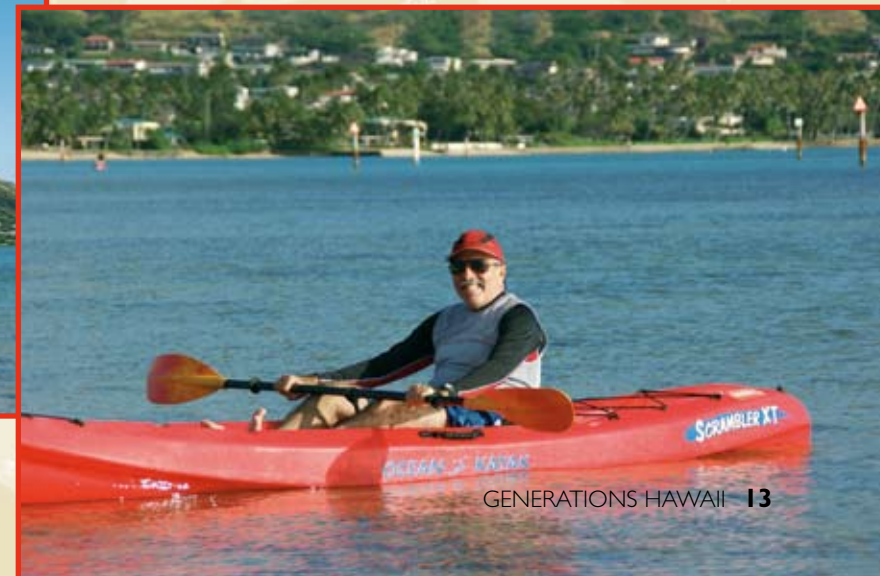
GENERATIONS HAWAII 13